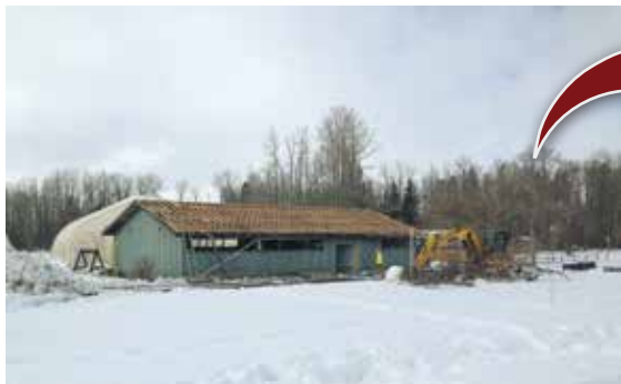
Old Mess Hall