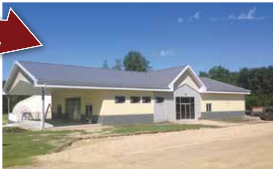
New Mess Hall