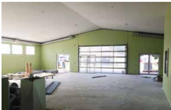
New Main Dining