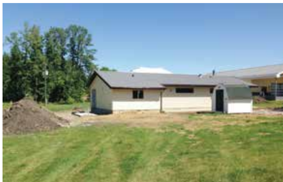
New Mechanical Room